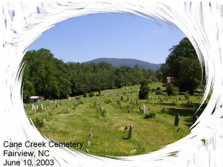
Cane Creek Cemetery Fairview, NC June 10, 2003